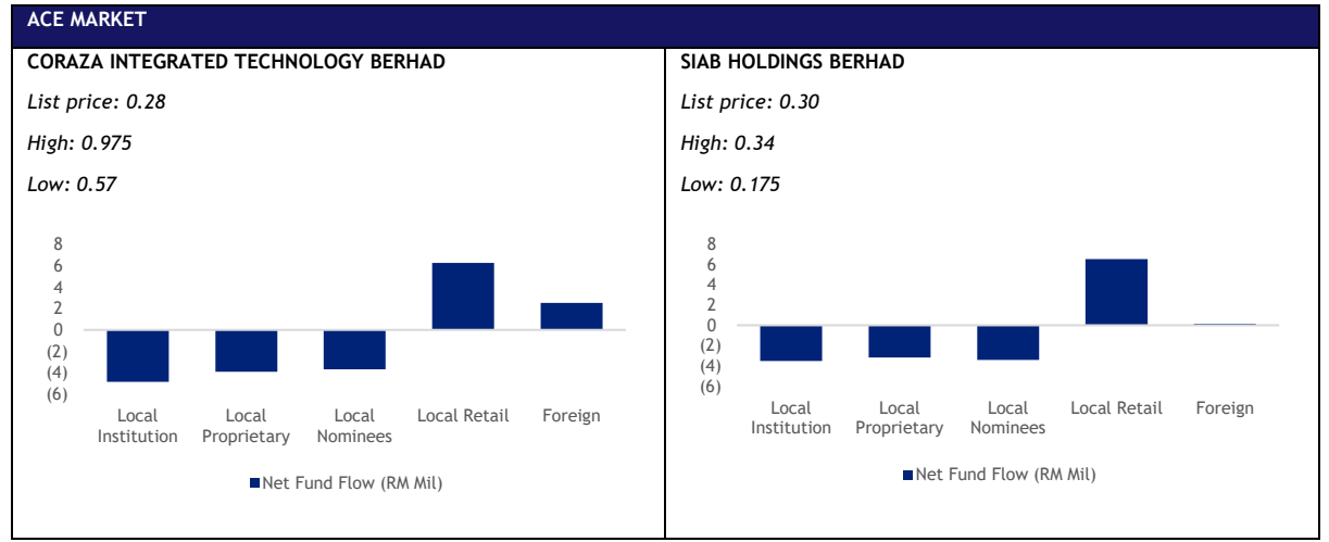
Note: Local proprietary includes IVT and PDT.

DISCLAIMER: This report is provided for general information purposes only. Although care has been taken to ensure the accuracy of the information within this report, Bursa Malaysia Berhad and its subsidiaries ("Bursa Malaysia Group") do not warrant or represent, expressly or impliedly as to the completeness, accuracy or currency of the information in this report. Bursa Malaysia Group does not endorse and shall not be liable for any information in this report that have been obtained via third party sources (if any).