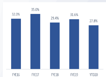
Return on Earnings (ROE)