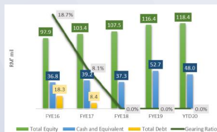
Balance Sheet Structure