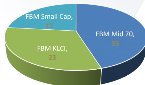
Chart 2: Number of Malaysian companies in the FTSE4Good Bursa Malaysia Index

In addition, the FTSE4Good Bursa Malaysia index is also open to small cap companies in the EMAS benchmark universe. Whilst small cap companies often perform less well on ESG metrics than large caps, approximately 17 of the constituents in the index are small caps, indicating a good knowledge of ESG principles among Malaysian corporates.