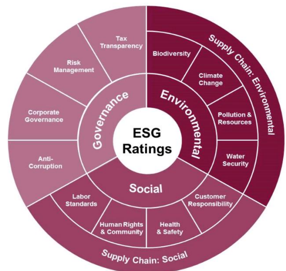
Chart 1: FTSE Russell ESG Ratings

Companies are assessed on issues relevant to 14 ESG themes include social and environmental supply chain.