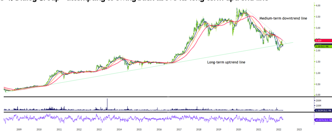
Figure 4: Dialog Group - attempting to swing back above its long-term uptrend line