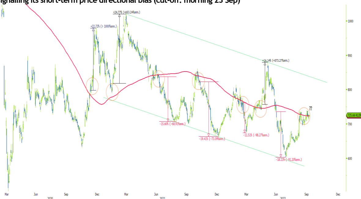
Figure 3: ENERGY - price actions (breakout/breakdown) around the 200-day SMA line are crucial in signalling its short-term price directional bias (cut-off: morning 23 Sep)

Referring to Figure 3, recent quarters' price evidence suggests ENERGY's price actions around the 200-day SMA line are crucial in defining its short-term price directional bias. The index experienced three breakouts and four breakdowns from the said SMA line since November-2020. On average, each breakout and breakdown produced circa +20% and circa -16% returns in the subsequent weeks. Technically, if ENERGY breaks out from the 200-day SMA line, investors may eye the index's next resistance at around the index's multi-quarter resistance line (green colour downtrend line). On the downside, a price rejection from the said SMA line could see the index developing a pullback over the short-term with the immediate support pegged at around the 50-day SMA line.