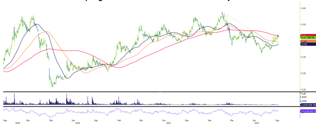
Figure 6: Bumi Armada - attempting a breakout from the 100- and 200-day SMA lines zone