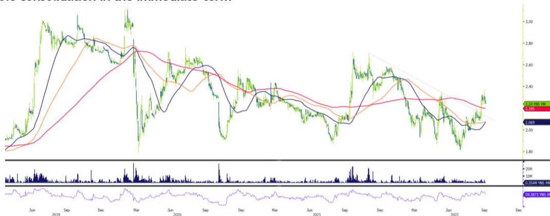
Figure 5: Yinson Holdings - broke above key SMA and multi-month resistance lines and developing a possible consolidation in the immediate-term

Yinson Holdings. After a sharp drop during the initial phase of the pandemic, Yinson Holdings has been trading sideways with a defined multi-quarter support zone of RM1.80 - RM1.90. The stock tested this zone three times this year, the last was after the completion of its two-for-five rights issue in July - removal of the cash call uncertainty. The stock's positive reaction to the support zone between Mid-July to Mid-September has pushed its share prices slightly above the 200-day SMA and multi-month resistance lines - a constructive medium-term observation. Recent price actions suggest a post-breakout consolidation is taking place in the immediate-term after its Daily RSI hit the overbought threshold. Towards the downside, the RM2.05 area (around the 50- and 100-day SMA lines) is likely to be seen as an immediate-term support zone, which if fail to hold could serve as a yellow flag to the bulls.