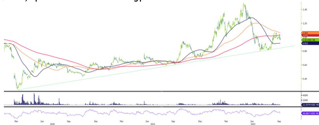
Figure 7: Hibiscus Petroleum - its rebound from the multi-quarter uptrend line stalled at around the 200-day SMA line, a possible consolidation is taking place in the immediate-term

Hibiscus Petroleum. A pure exploration & production (E&P) play, Hibiscus Petroleum has the most immediate exposure to crude oil/natural gas prices. Following its sharp 47% retracement between May-July, the stock experienced a “Bottom-Building” process between Mid-July to Mid-August around its uptrend line that stretches from the pandemic’s low, before staging a rebound. The rebound has likely reached an interim top recently at around the 200-day SMA line as the stock has been showing signs of developing a possible consolidation. On the upside, a firm breakout from the 200-day SMA line would be seen as a possible positive price signal. On the downside, the RM0.900 area (located near the 50-day SMA line) is likely to be treated as a support zone, which if broken could see the stock retesting its uptrend line.