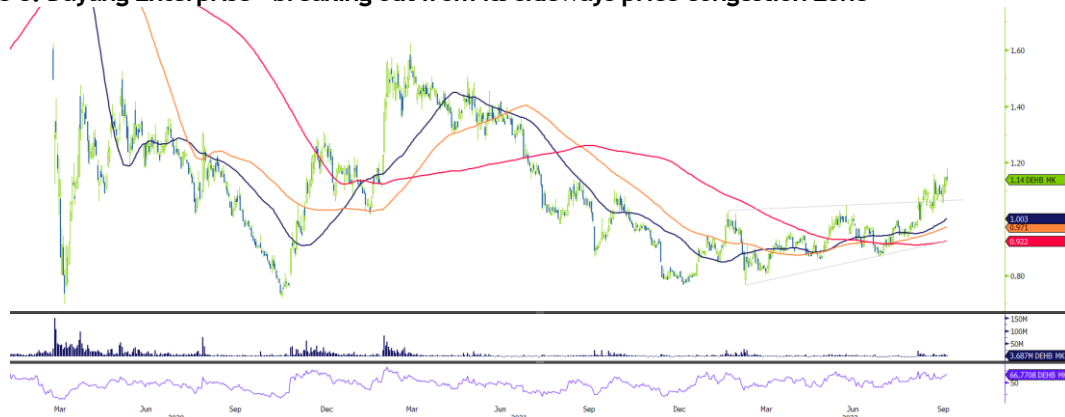
Figure 8: Dayang Enterprise - breaking out from its sideways price congestion zone