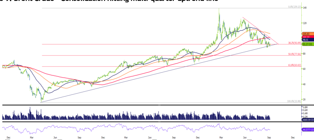
Figure 9: Brent Crude - Consolidation hitting multi-quarter uptrend line

Referring to Figure 9, after a fake breakout from its multi-month resistance and 200-day SMA lines in End-August, Brent Crude extends its mid-cycle consolidation phase. The commodity is still trading within the retracement leg that started from the high in June. Towards the upside, the commodity needs to break above its multi-month resistance line for its short-term technical picture to turn positive. Meanwhile, support zones are eyed at USD85-USD87 (located around the uptrend line that stretches from the pandemic's low), and followed by USD75-USD80.