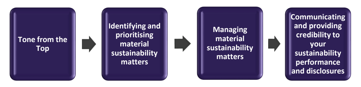
Figure 1: Key considerations for embedding sustainability

Organisations can benefit most when they successfully embed sustainability rather than considering it separately, on a standalone basis. The following provides some key considerations for an organisation seeking to embed sustainability in its business strategy and leveraging sustainability to reduce risks and take advantage of business opportunities: